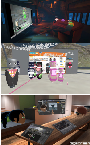
Figure 3: Examples of shared at-a-distance VR experiences: Convrge Cinema a where users could watch films together at-a-distance; UIST 2019 VR poster session b where virtual attendees could take part in a purely VR poster session at UIST; and BigScreen VR c where users could selectively share, and collaborate using, captured OS desktop instances/applications.