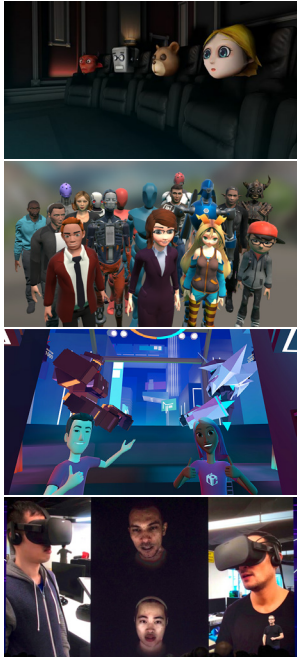
Figure 2: Examples of more VR-oriented social experiences where avatars are used to convey social presence, giving users more control over their appearance, but conveying less innate social cues. From top: Oculus Social Alpha a from 2015; VR Chat b ; Facebook Horizon c ; and Facebook's Codec Avatars: Conversation in VR .